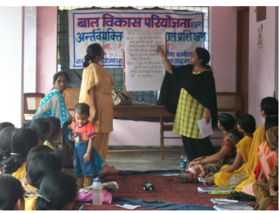
TOT of Mukya Sewikas