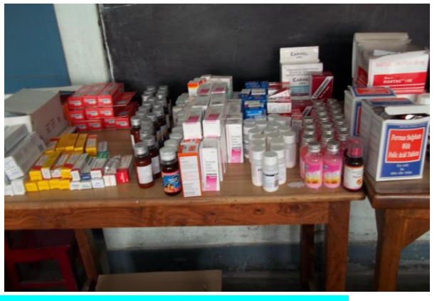
Networking with the Govt and Non Government Organizations for Health Camp. Community Health Program - Gosaiganj block, District of Lucknow