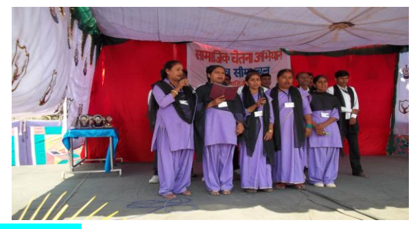
Work with women