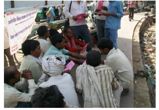
explaining about the benefits of union