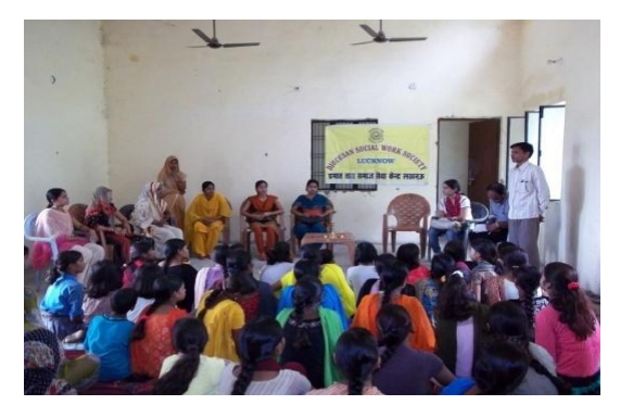
Inauguration of center