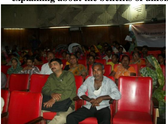
Our participation in May day at Railway stadium & cooperative auditorium