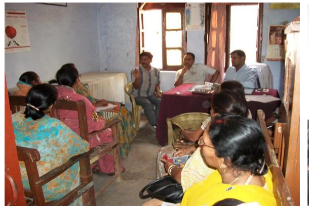
Discussion at Convergence Meeting