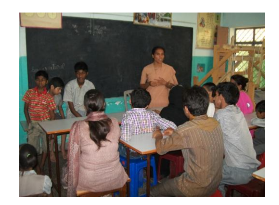
Visiting the children in the institutions by the mediator.