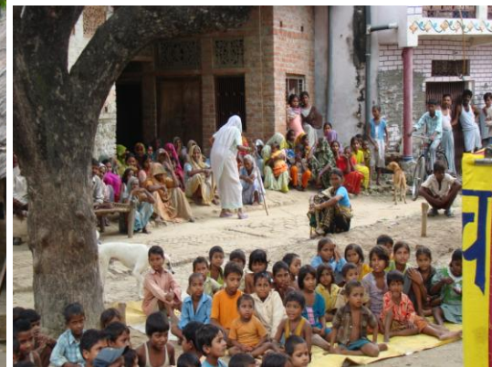
Mass Awareness through Puppetry