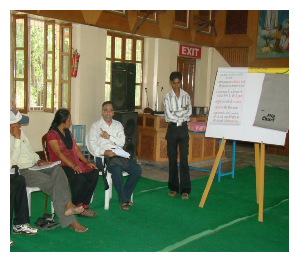
Monitoring of the Program