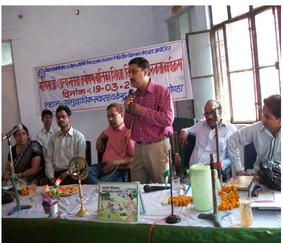
Liaising with Government Officials